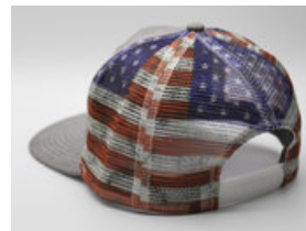
custom printed mesh