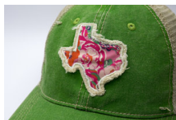
double patch sublimated w/ frayed fabric